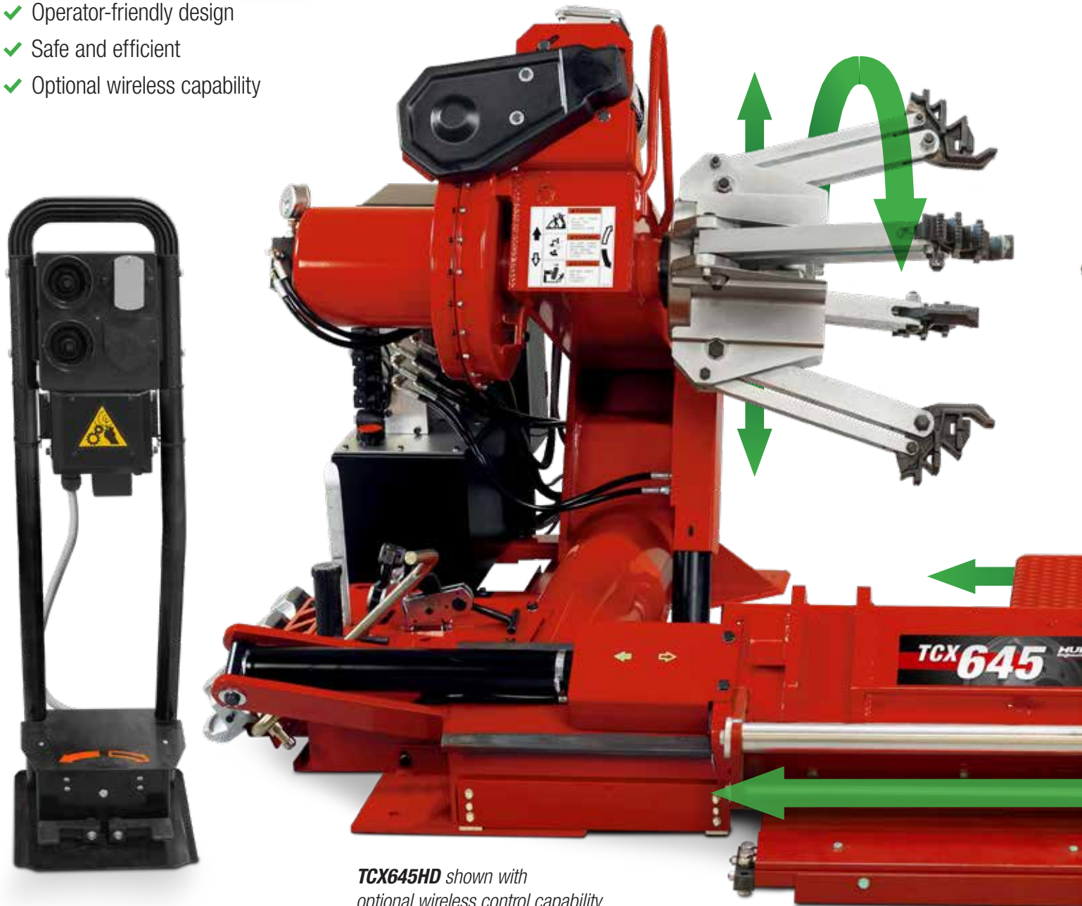
TCX645HD shown with optional wireless control capability