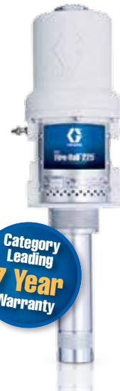
Mini Fire-Ball 225